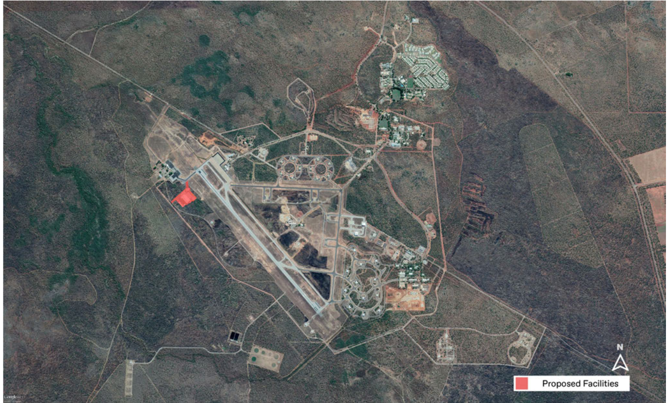
Proposed Location of Facilities RAAF Base Tindal (NT)