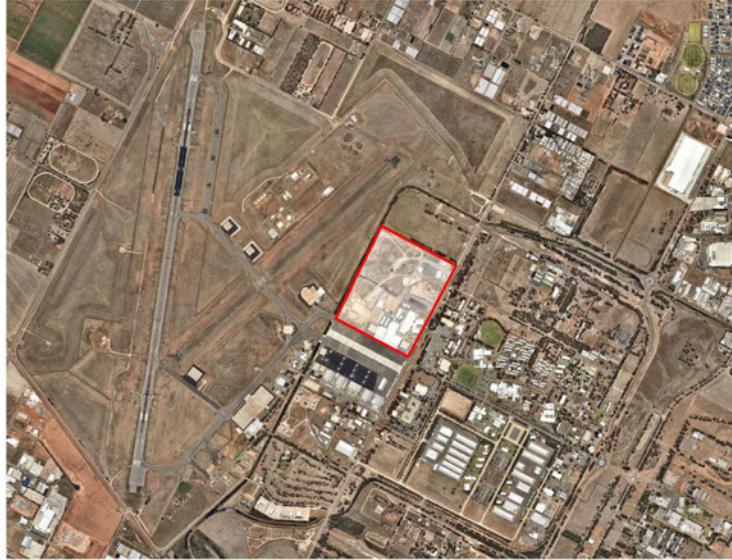
RAAF Base Edinburgh and ISR Precinct

Proposed Location of Facilities RAAF Base Edinburgh (SA)